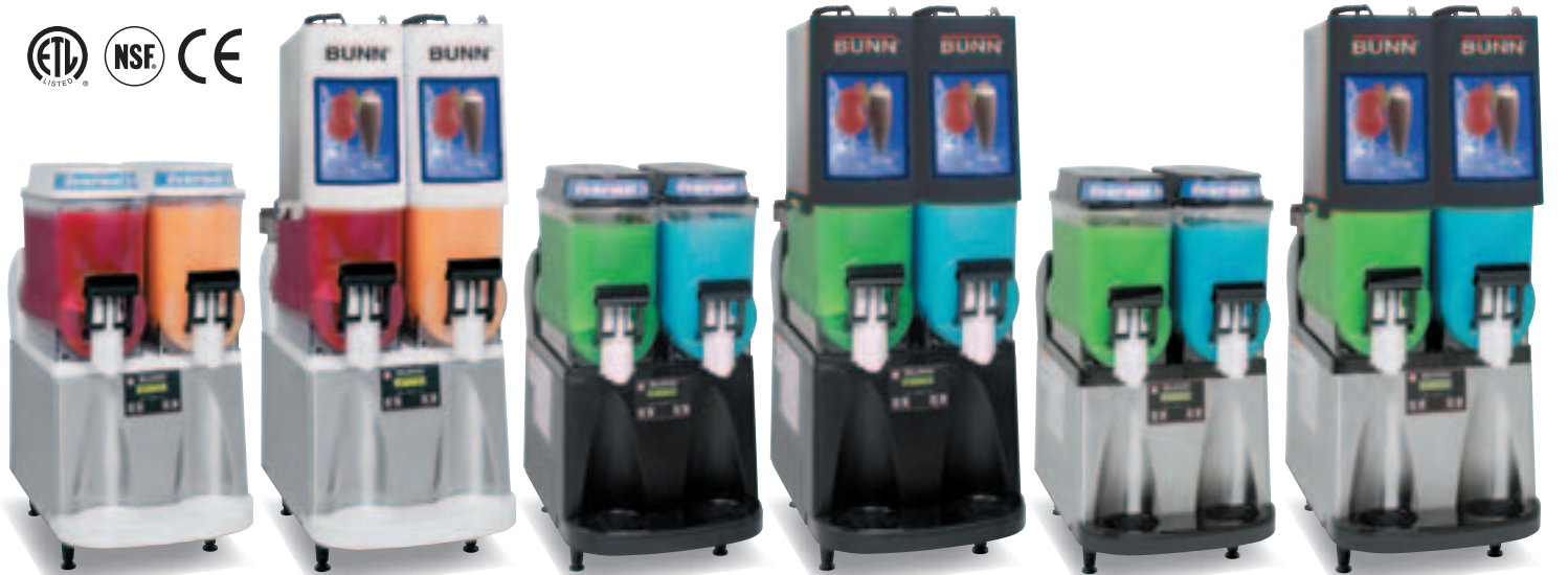
Ultra-2 White and Stainless Ultra-2 PAF White and Stainless Ultra-2 Black Ultra-2 PAF Black Ultra-2 Black and Stainless Ultra-2 PAF Black and Stainless

Check out the complete line of Ultra Gourmet Ice Systems at www.bunn.com .